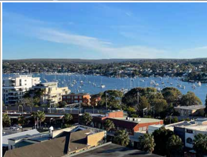
Spectacular views from the rooftop pool.